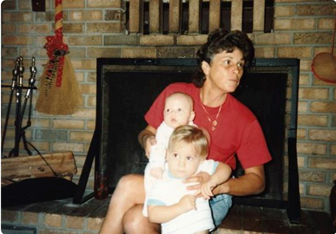
April with 1st grandkids Oct 1989